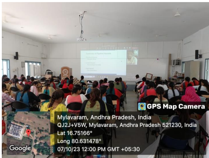
Students listening the guest lecture