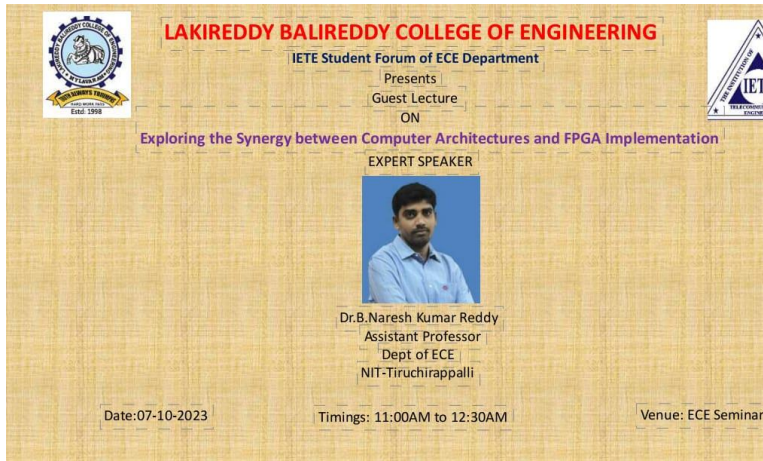
Guest Lecture Poster