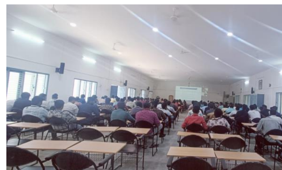
Students listening the guest lecture